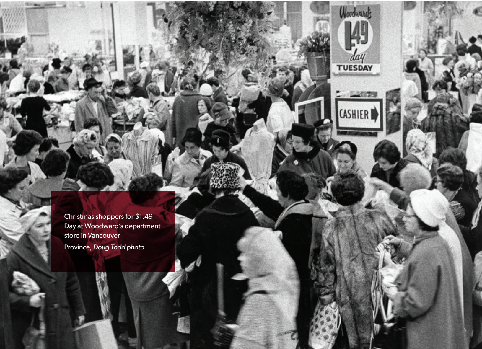
Christmas shoppers for $1.49 Day at Woodward's department store in