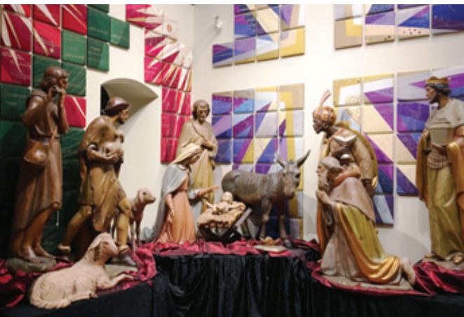
LEFT Every year, since 2013, Christ Church Cathedral has displayed the former Woodward's nativity scene Eve Lazarus photo, 2018